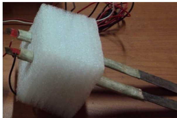
Fig.2: Photograph of a Soil Moisture Sensor

A designed resistive sensor is used to sense the moisture content in the soil. It works on the principle of electrical conductivity. Resistance of the sensor is inversely proportional to moisture content in the soil. Moisture content of the soil is a major factor determining plant growth. The present work comprises of development of a soil moisture sensor. Figure 2 shows the Photograph of a Soil Moisture Sensor.