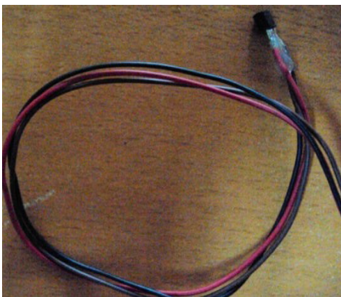
Fig.1: Photograph of a LM-35 Temperature Sensor