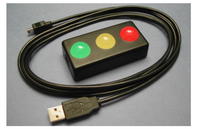
Fig 3. Wire of Indicator