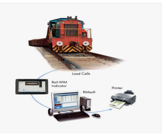
Fig 5. A Prototype Model