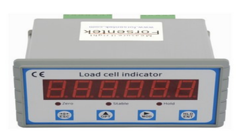
Fig 2. Indicator (Front)