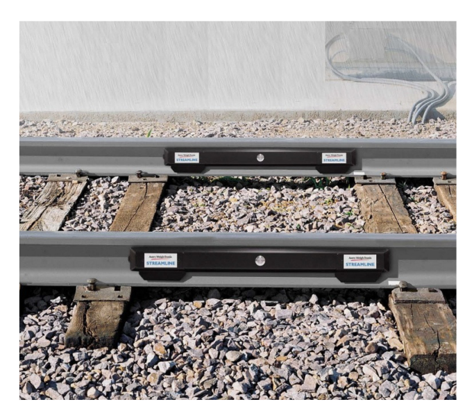
Fig 1. Load cell