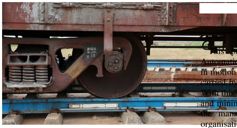
Fig 4. Placing of loadcell

The similar project is already placed to serve railways sectors. In this the loadcell calculate the weight of the wagon on the base of the axel available with the single wagon. The total axel will be calculated on average except for the engine and the guard. The calculated details will be shown on the indictor and would be forwarded to the system app so that the info might be stored for the future use. The details might get change while transferring data so we need to provide more advance security system so that it might not be accessible to authorized personnel only.