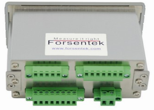
Fig 2. Indicator (Backside)