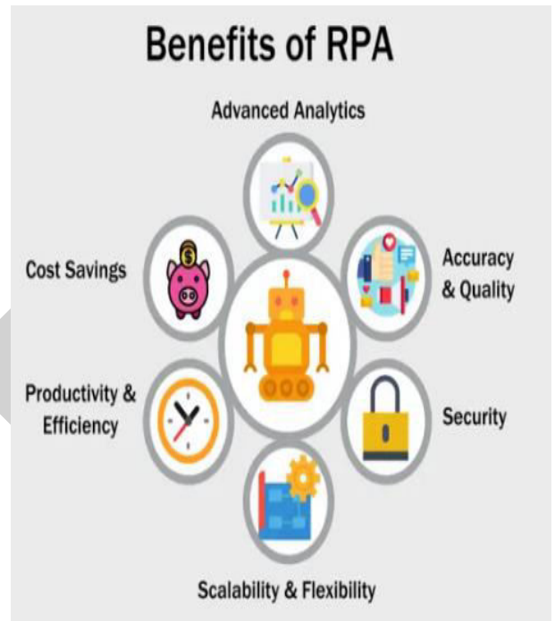
Figure 3 Algorithm Process